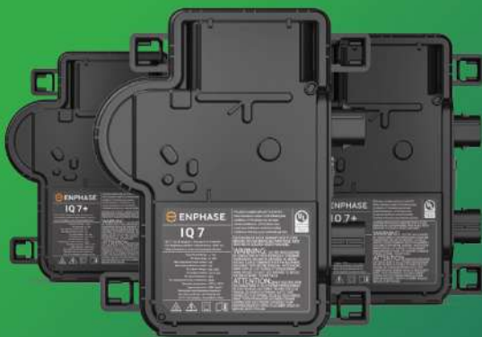
ENPHASE IQ MICROINVERTERS